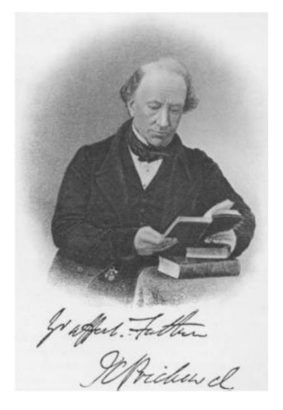
Figure 2.1 James Cowles Prichard<sup>15</sup>

himself in order to prepare and circulate a questionnaire to help the voyagers to collect ethnographic information.<sup>14</sup>