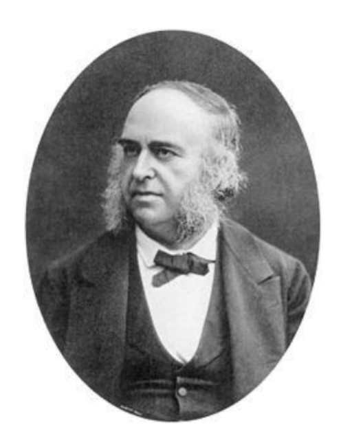
Figure 2.2 Paul Broca<sup>34</sup>