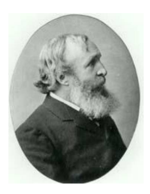
Figure 2.3 Charles Loring Brace<sup>47</sup>

abolitionist Charles Loring Brace.<sup>46</sup> Overall, the approach of Brace started from the traditional view of ethnology at the time, a comparative study of peoples, with emphasis on its history and culture. Athenaeum highlighted the benefits that the new learned societies would bring to the development of studies of man, and especially the Anthropological Society of London, with particular emphasis placed on the figure of Hunt.