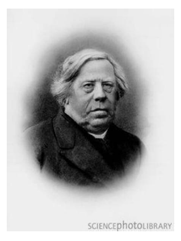
Figure 3.2 Charles Pritchard<sup>34</sup>

when he was elected as Savilian Professor at Oxford. With the support of Warren de la Rue (1815-1889), Pritchard succeeded in establishing a new observatory for the University. His work included the systematic study of stellar photometry and the application of photography to the determination of stellar parallax. He was also a member of the Royal Society from 1840, and received a royal medal for his work as astronomer in 1892.