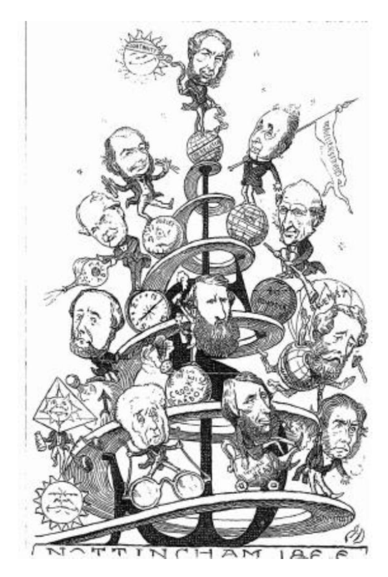
Figure 3.3 "The Philosophers of Nottingham" 48

The general idea of the image conveys a good summary of what was said and done at the Association at this period, with the firm idea of bringing science to the people, like a circus visiting various locations to entertain the audience with various acts. The efforts of the President and the rest of the members of the Association was to present different competing views of nature and science in order to consolidate them.