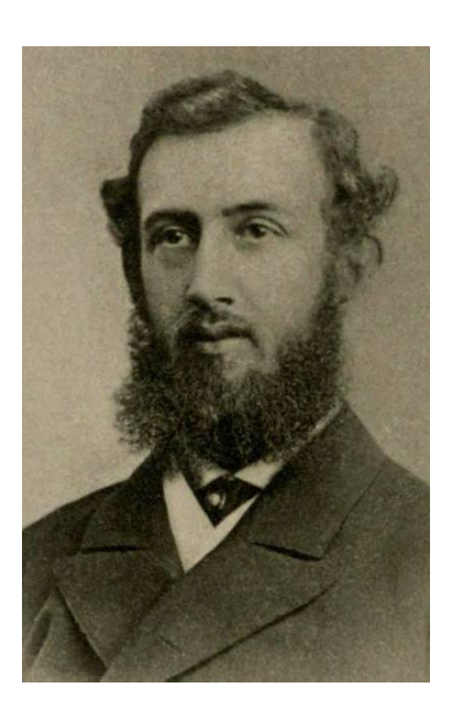
Figure 2.4 William Winwood Reade<sup>70</sup>

referred to blacks in this way: "No one will be rash enough, I presume, to say that God created these wretched creatures in order to punish them hereafter; and I have already shown that Christian missions do not tend to elevate them in the moral scale".<sup>69</sup>