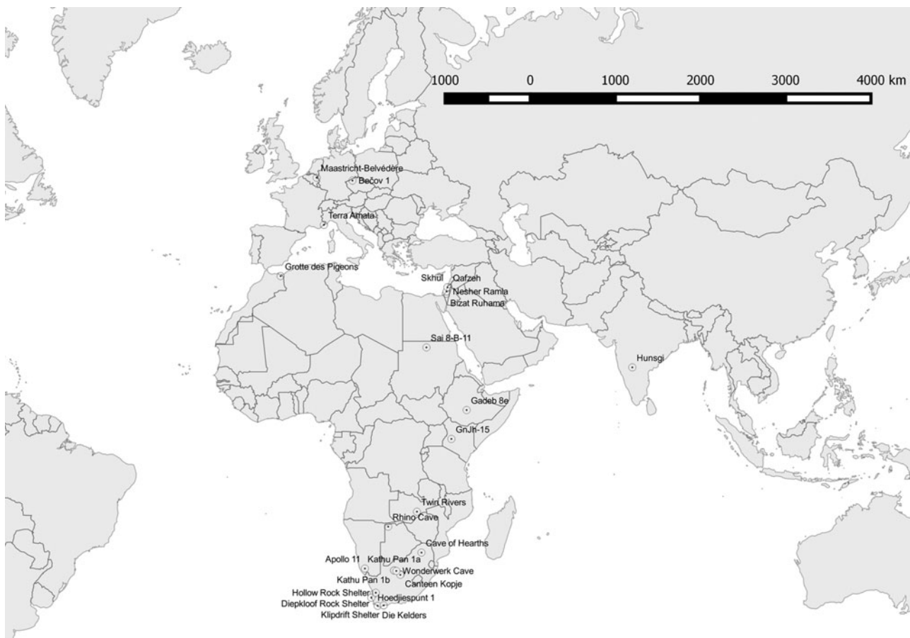
Figure 2. Sites that have recorded use of ochre. (Data from Kissel & Fuentes in review.)

pressed to disprove the null hypothesis that an object has symbolic grounds. Because of this, we are sceptical of ever proving or disproving symbolic thought in a Peircean sense without detailed knowledge of the cultural practices.